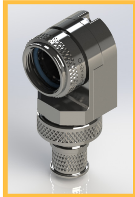
Table 1 Shell Size